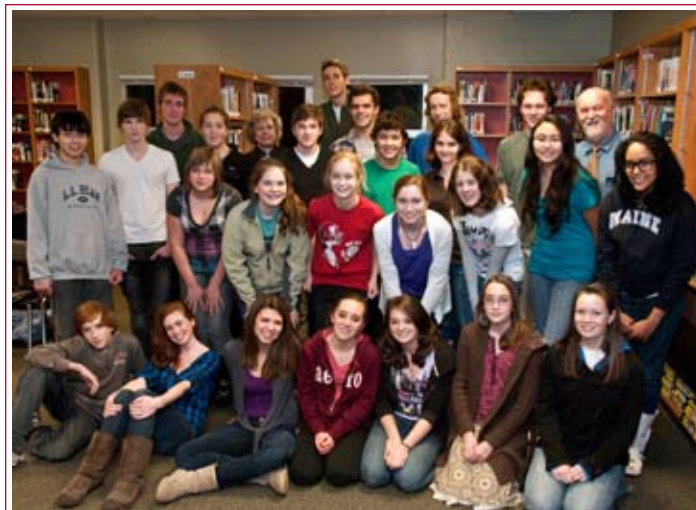
Members of the CEHS Speech Team revel in their victory as state champions

“Being a member of the Speech Team has been a wonderful experience for me. It has been educational and fun, and I’ve gotten to meet and share experiences with kids from other schools. We all appreciate the financial help from CEEF that helped to make our very successful season possible!”