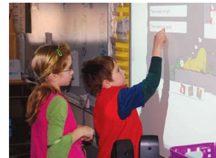
Two first-graders enjoy the new Pond Cove technology.