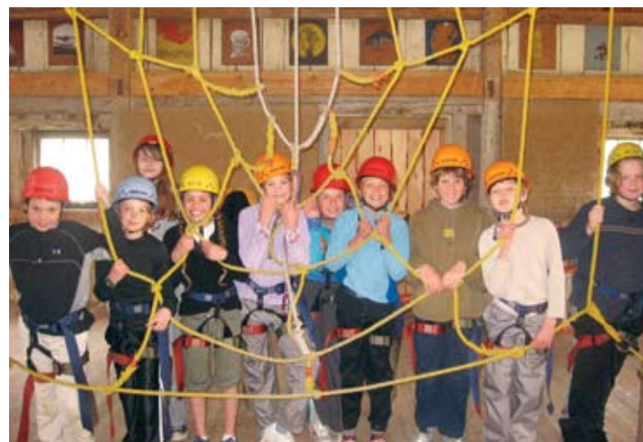
Hardy middle-schoolers take on the “spider web” at Chewonki in 2009

CEEF complemented this work and in response to a grant request, awarded $10,000 over the next three years to offset staff, transportation, and other related costs. Moreover, as part of CEEF’s effort to accept targeted donations, an anonymous donor matched the CEEF award, further ensuring the continued legacy of this much-loved tradition.