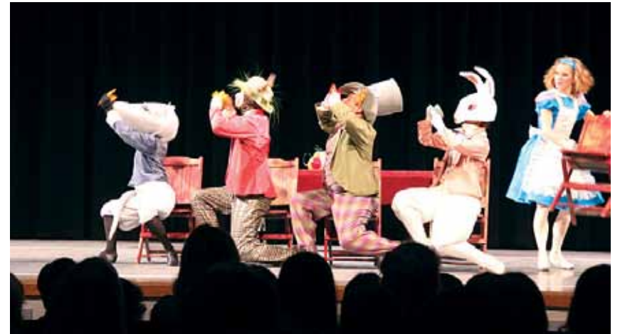
Students enjoy a performance of Alice in Wonderland by the Maine State Ballet

"During CEHS robotic's program infancy, CEEF recognized the importance of STEM related extracurricular activities and provided important initial funding. The program has grown from just a few to now nearly a hundred participating at each education level of our school system. The children are introduced to engineering, programming and project management in a fun and interactive way."