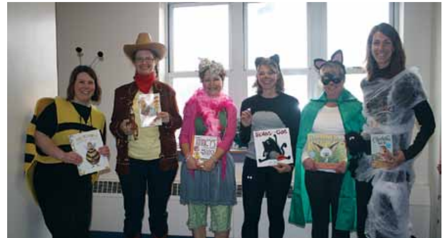
Pond Cove teachers prepare for the character parade during Cape Celebrates Literacy week