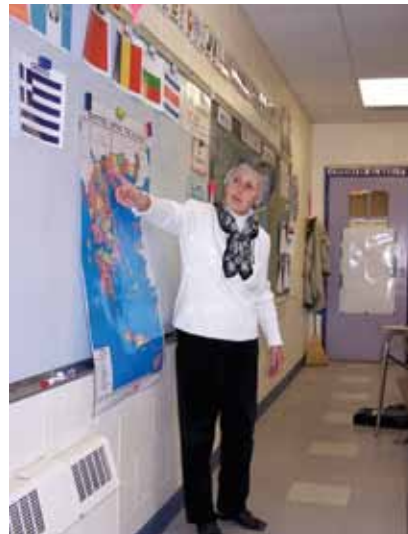
The Global Connections initiative at the MS