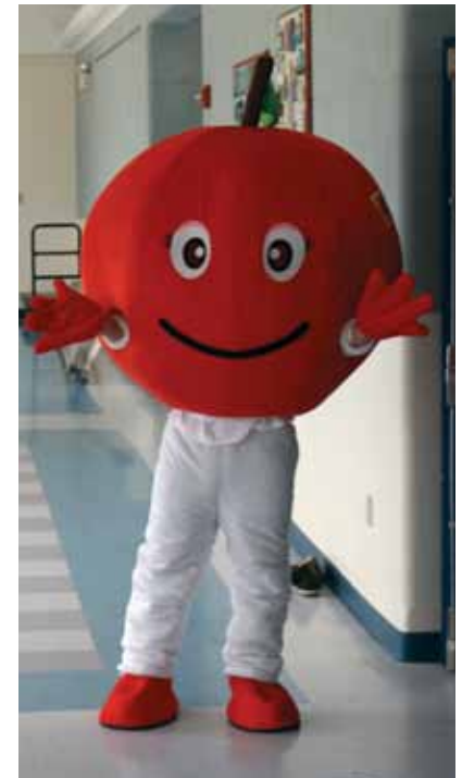
The CEEF Red Apple enjoys AuthorFest