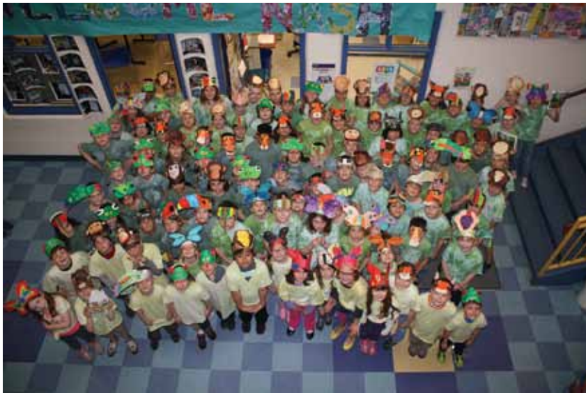
Pond Cove joins in the literary fun

The week culminated on Saturday afternoon with AuthorFest, when thirty authors and illustrators gathered in the high school gym to read excerpts, sign books and mingle with Cape students and their families.