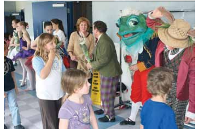
Characters from Maine State Ballet greet students after the performance

Fueling innovation and excellence in our schools