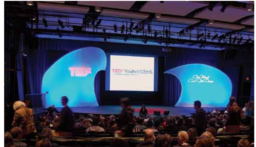
Maine's first ever TEDx Youth day at CEHS, December 7, 2012