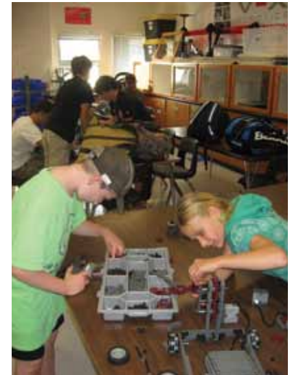
Robotics enthusiasts work on their project