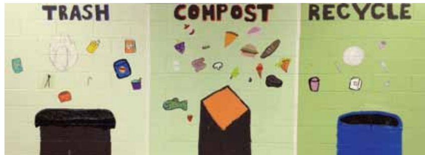
The Waste Management mural on the Cafetorium wall helps students to sort their leftover waste