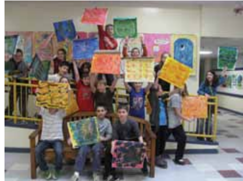
Fifth graders show the fruits of their paste paper projects