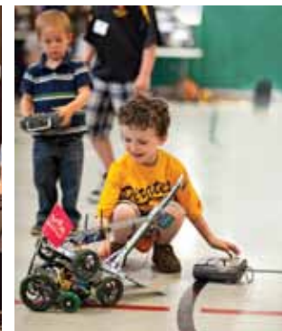
Budding robotics engineers