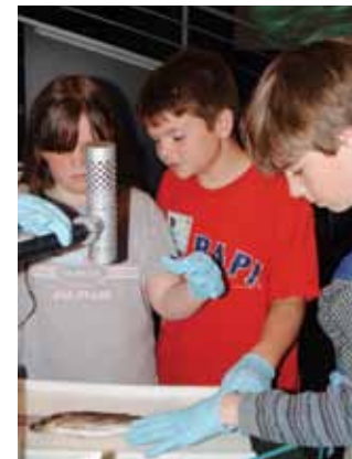
5th graders at GMRI's LabVenture!