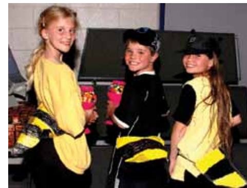
The Bee-hinds join the fun