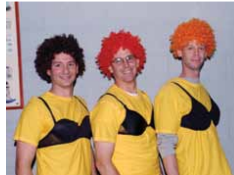
The BEE Cups are ready to spell!