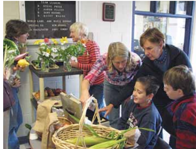
Farmer's Market offered by students in the middle school Life Skills class

"On behalf of the entire Cape Elizabeth High School Mock Trial Team, thank you for your generous contribution! Your donation enabled the team to travel to Albuquerque, New Mexico to represent the State of Maine in the 2012 National Mock Trial competition." Mock Trial Members Spring 2012