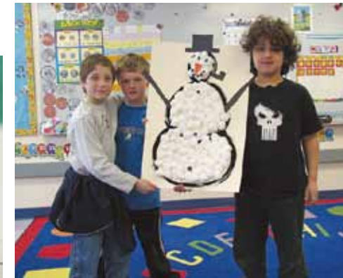
Math made fun at Pond Cove's Math Lab