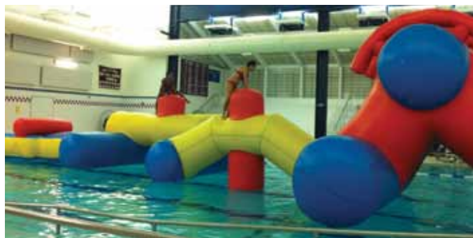
Cape Fusion is the most recent of the thriving CEEF-seeded programs.