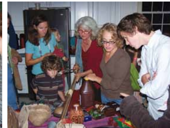
World Language sponsors Hear Our Stories series