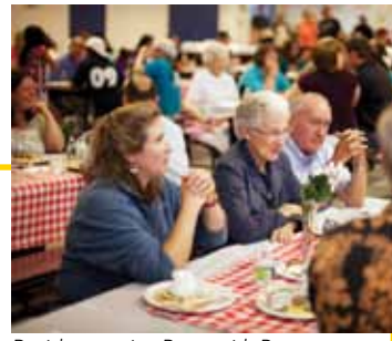
Residents enjoy Pasta with Purpose