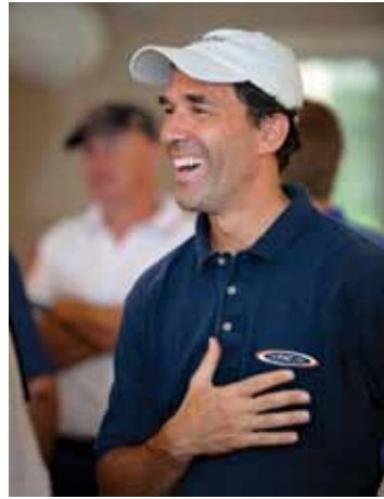
The Golf Tournament raised over $8K