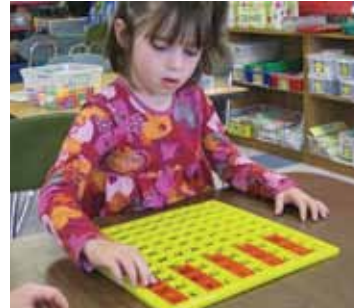
Pond Cove Math Lab nurtures curiosity