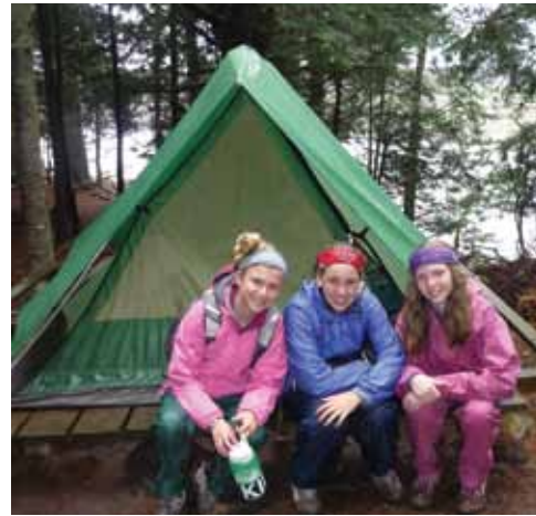
Sixth grade students enjoying the Chewonki experience