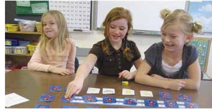
Young mathematicians hone their skills at PC Math Lab

Each of these grants fuels learning opportunities for all Cape Elizabeth students and professional growth for the teachers and staff. It is generous donors that make these programs a reality, contributing to the culture of excellence, innovation and personal achievement that is a hallmark of our school district.