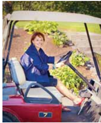
Inaugural Golf Tournament, 2011