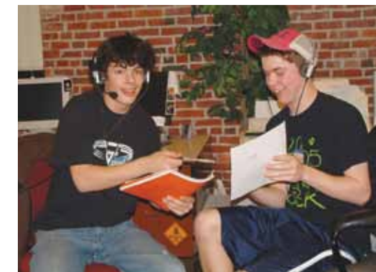
Students help out during a phonathon