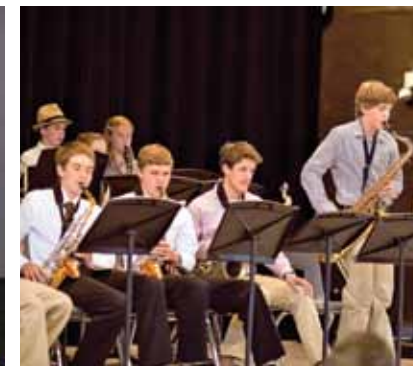
Jazz band entertains at Pasta with Purpose