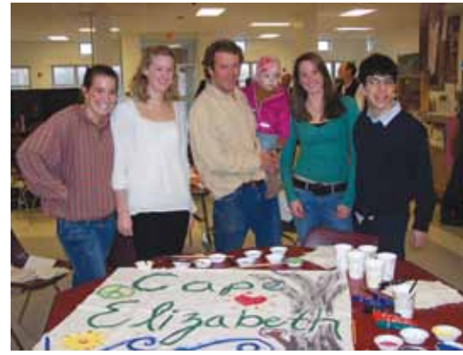
Flatbreads' a big hit on Chef of the Month day at CEHS