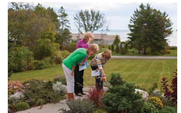
Garden enthusiasts admire the plantings outside a home on the tour

Thank you to all who helped make the day wonderful.