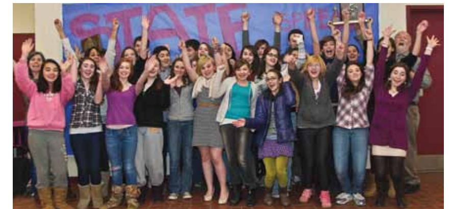
CEHS Speech Team celebrates its second State Championship in two years

We have worked to ensure accuracy and offer our sincerest apologies for any missed or misspelled names or other inaccurate information. If you discover any errors, please email info@ceef.us.