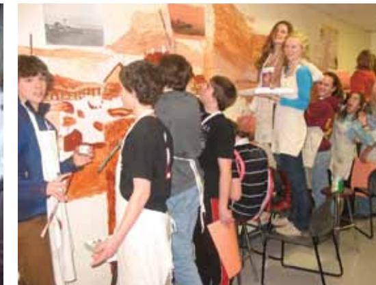
Professional development comes alive with artwork that endures