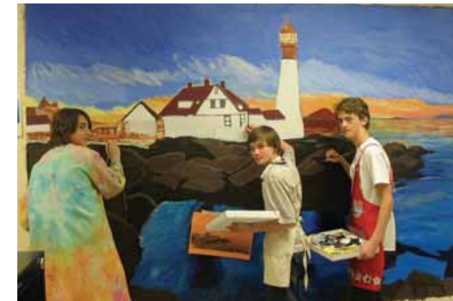
CEMS murals brought to life with a CEEF grant

As we celebrate CEEF's 10th anniversary, we recommit ourselves to the ideals and objectives that our founders and donors imagined ten years ago: supporting innovation and excellence in Cape Elizabeth schools. We invite you to join us in this mission by making a donation that will have enduring value for our students and community.