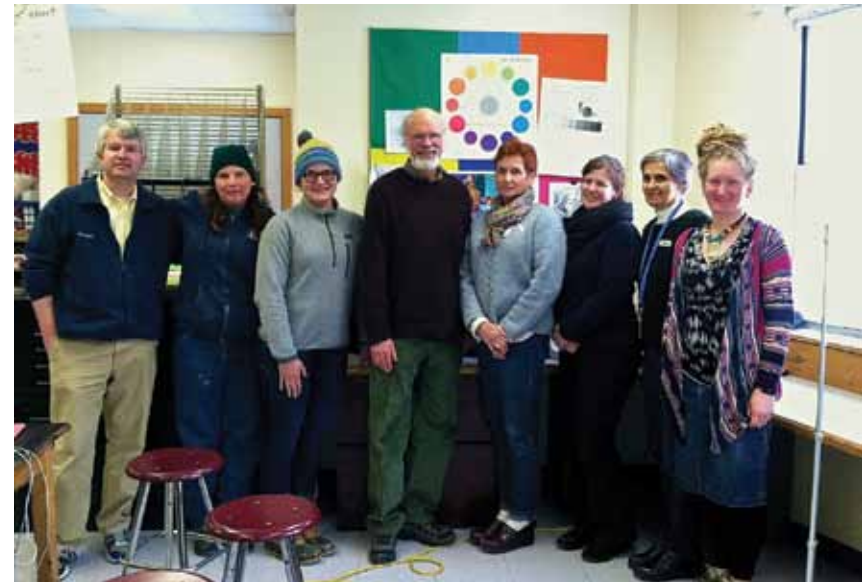
Adults involved in the Animated Integration Studies grant

Donations are from July 1, 2013 to June 30, 2014. We have worked to ensure accuracy and offer our sincerest apologies for any missed or misspelled names or inaccurate information. If you discover errors, please email us at: info@ceef.us .